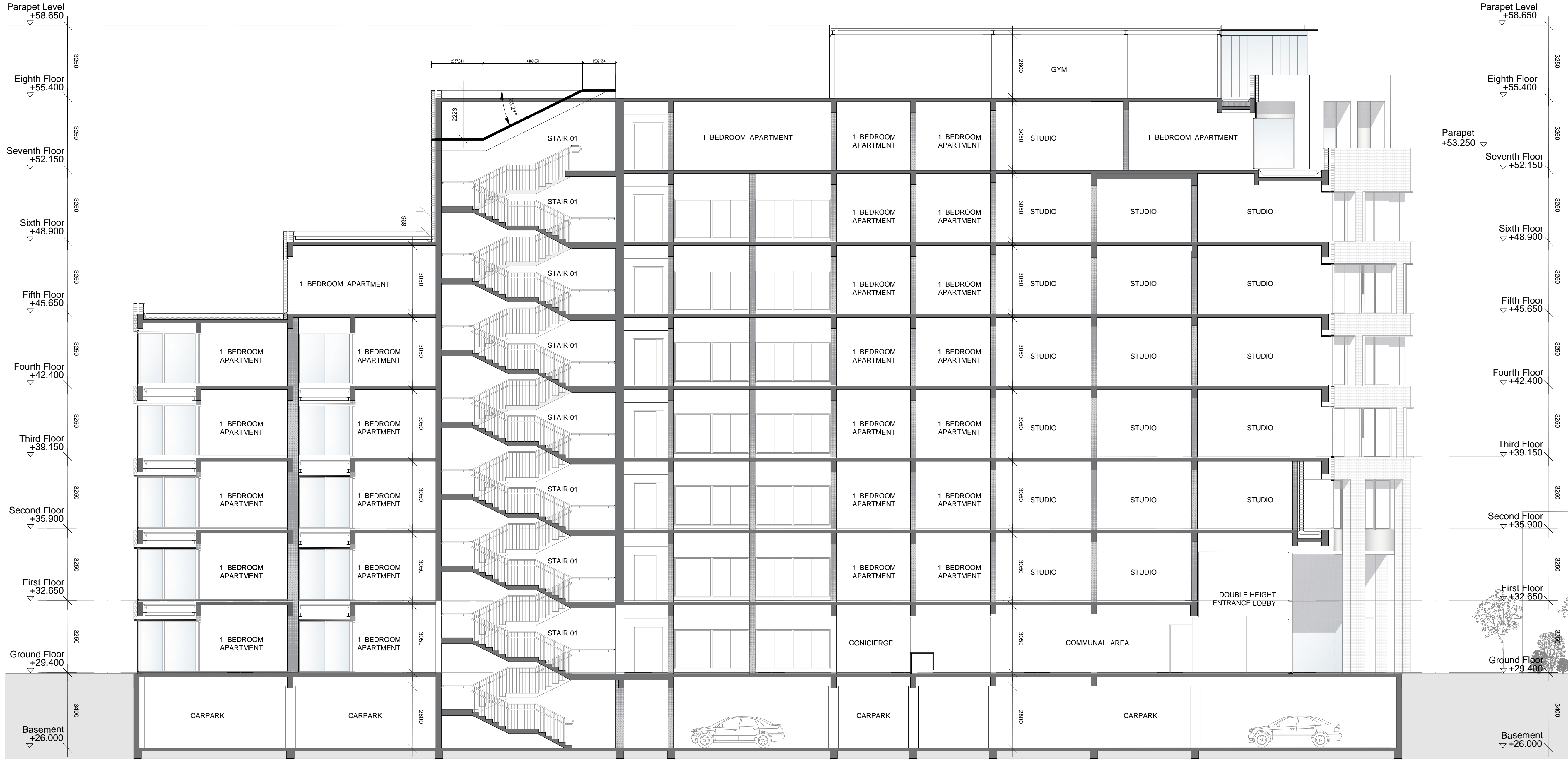
Section B-B - Scale1:100@A1

NOTE ALL DIMENSIONS TO BE CHECKED ON SITE NO DIMENSIONS IS TO BE SCALED FROM THIS DRAWING THIS DRAWING IS TO BE READ IN CONJUNCTION WITH RELEVANT CONSULTANTS DRAWINGS